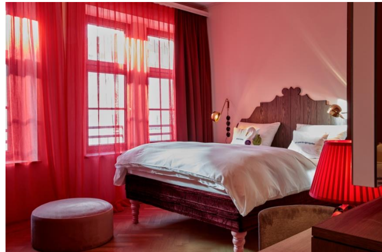
swan suite from eur 159 peacock suite from eur 499