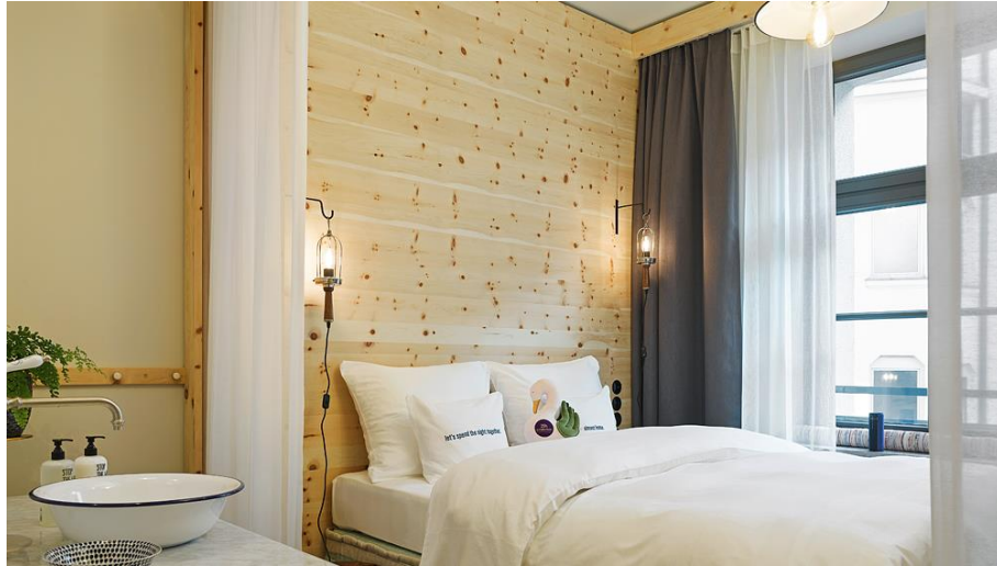
box room from eur 149