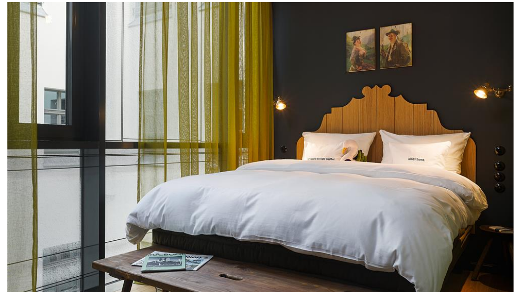
chamber from eur 169 grand chamber from eur 189